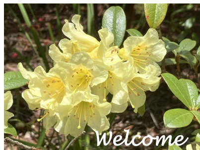
Rhododendrons, Blue Mountains