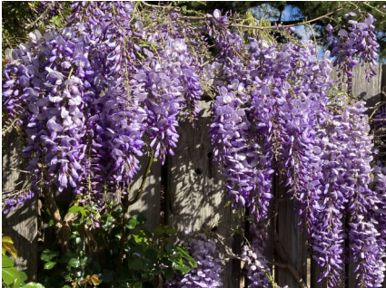
Wisterias, Blue Mountains